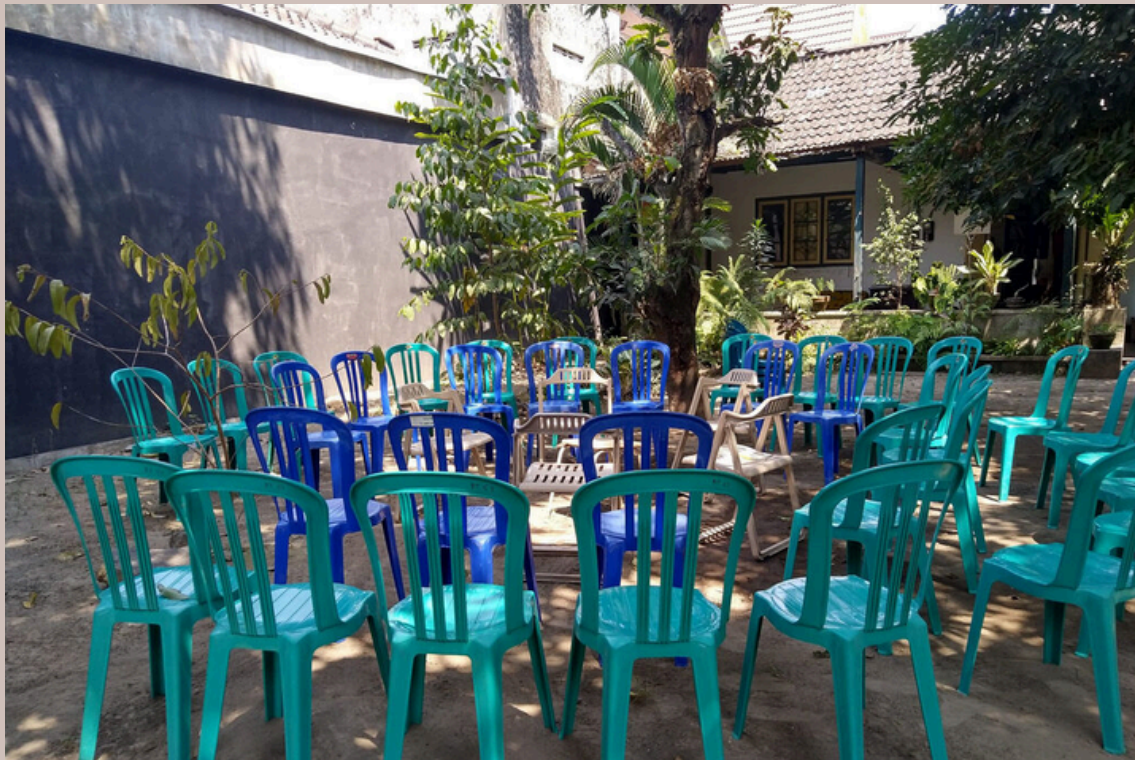
The big circle meeting during KUNCI's 20th birthday, Yogyakarta, August 29, 2019.

The symposium presents the output of the IMAGINART research project on Imagining Institutions Otherwise: Art, Politics, and State Transformation (2020-2026), while expanding its scope through a focus on Amsterdam, the Netherlands, and the current conjuncture in order to tackle core political urgencies affecting the role cultural institutions play in society.